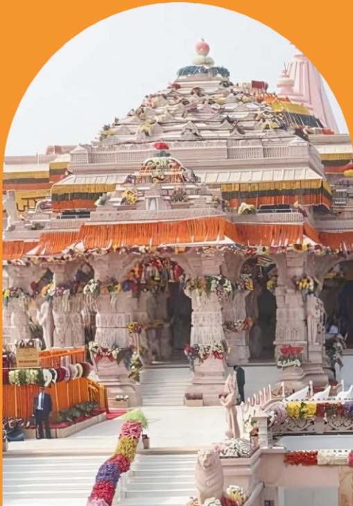
RAM LALA MANDIR,AYODHYA

Nestled in the sacred city of Ayodhya,UP,India the Ram Lala Mandir is a beacon of faith and devotion for millions. This revered temple, dedicated to Lord Ram, stands as a testament to timeless tradition and spiritual heritage. Visitors are invited to experience the divine ambiance, witness the intricate architecture, and partake in the rich cultural legacy that the Ram Lala Mandir embodies.