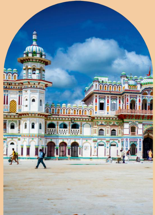
JANAKI MANDIR, JANAKPUR DHAM

Nestled in the sacred city of Ayodhya,UP,India the Ram Lala Mandir is a beacon of faith and devotion for millions. This revered temple, dedicated to Lord Ram, stands as a testament to timeless tradition and spiritual heritage. Visitors are invited to experience the divine ambiance, witness the intricate architecture, and partake in the rich cultural legacy that the Ram Lala Mandir embodies.